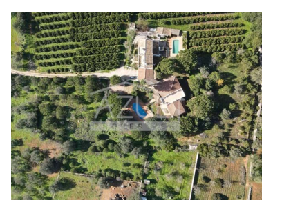
₽ 6 Bedrooms